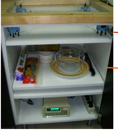
Weighing sensor deployment and space layout of smart counter (the upper line) and smart cabinet (the lower line)

To test its feasibility, we have created a preliminary prototype of a smart kitchen show in Figure 3.