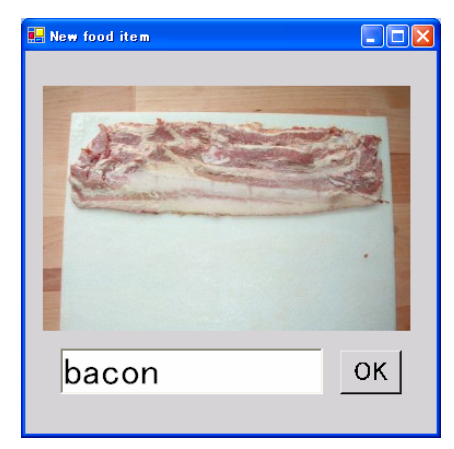
figure 4. Dialog window for asking input the name of new food item in the system.